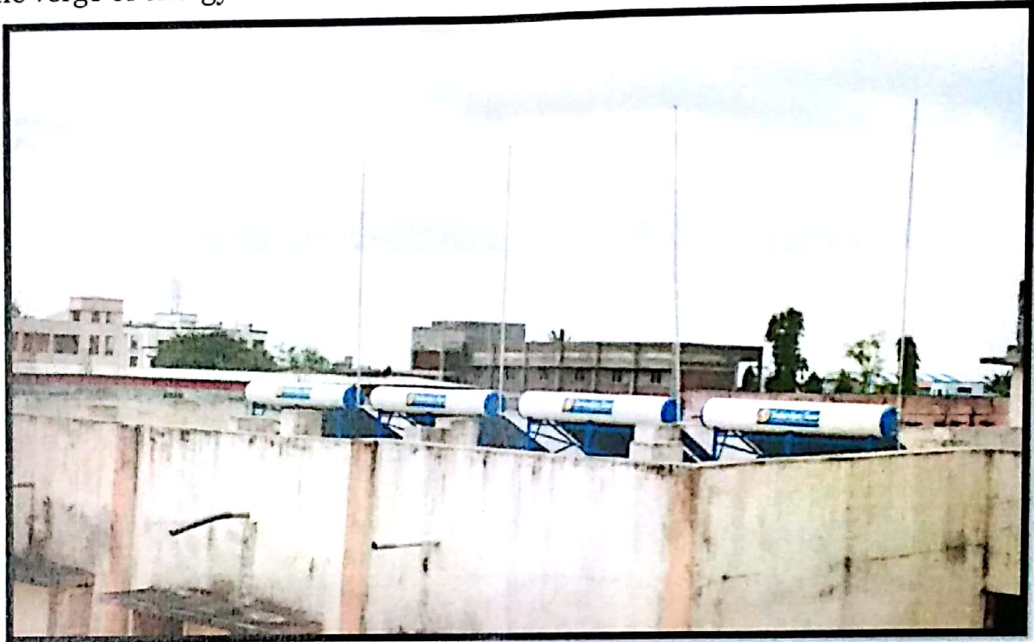
Solar panels of 20 KWH/month

Solar panels are installed as nonconventional energy source when the world is at the verge of energy crisis.