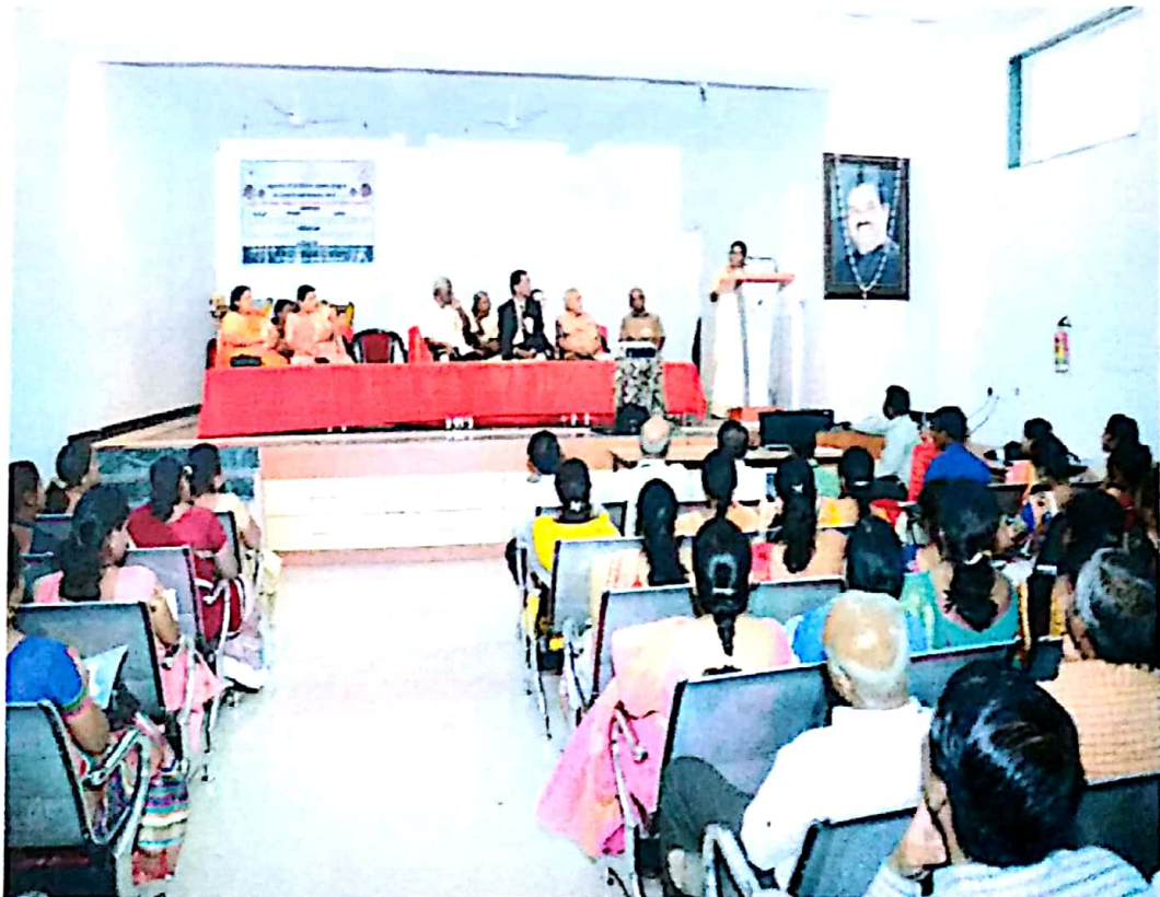
Audience with enthusiasm