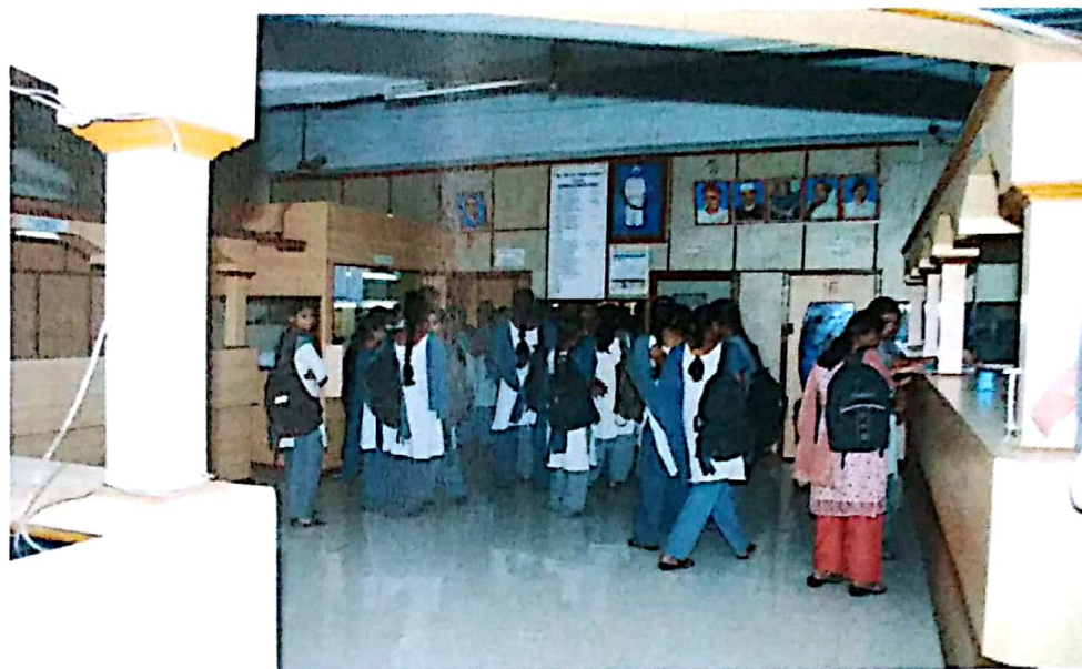
Girls at the counter in the office