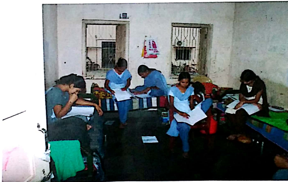
Girls studying in their rooms of the hostel

Institute has installed solar systems of capacity 20 KW which generate power 2400 KWH/Month. Institute has installed 62 Nos of PV panels of 320 W, 2 Nos of MMPTs & 1 No of Inverter of capacity 20 KW.