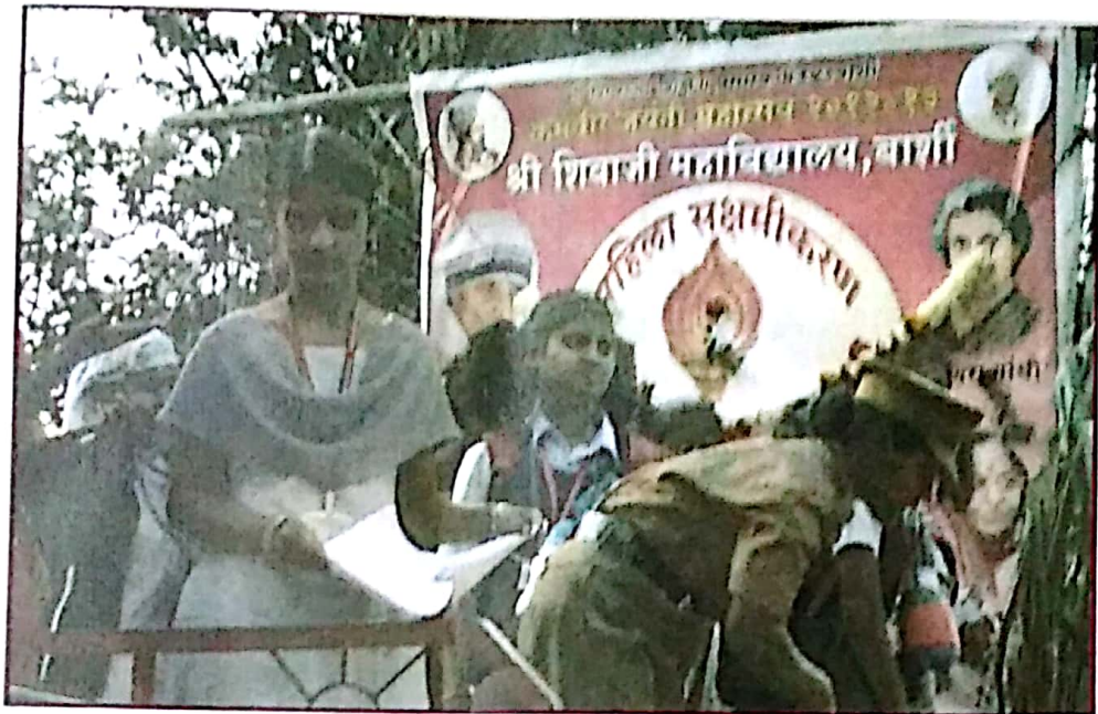
Girls in the rally for women empowerment