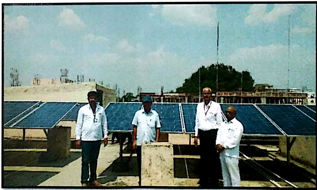
Maximum Power Point Tracking (MPPT) Solar Charge Controller