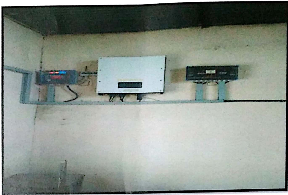
Solar control panel

Institute has installed solar systems of capacity 20 KW which generate power 2400 KWH/Month. Institute has installed 62 Nos of PV panels of 320 W, 2 Nos of MMPTs & 1 No of Inverter of capacity 20 KW.