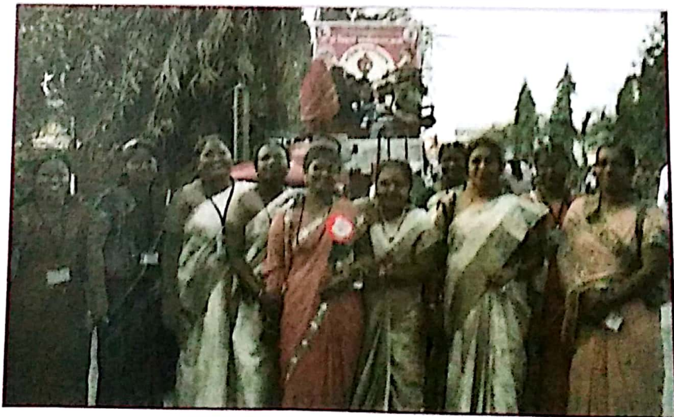
Women staff cheering the participants